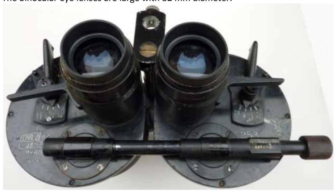
The eye lenses; Copyright pictures Anna Vacani

The binocular eye lenses are large with 32 mm diameter.