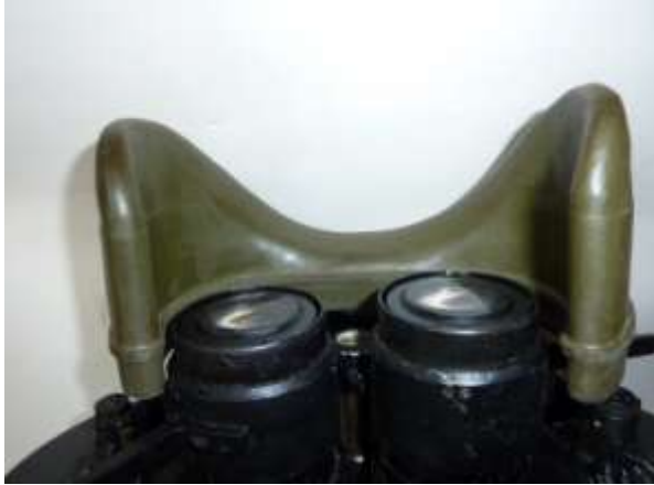
without eye cups; Copyright pictures Anna Vacani