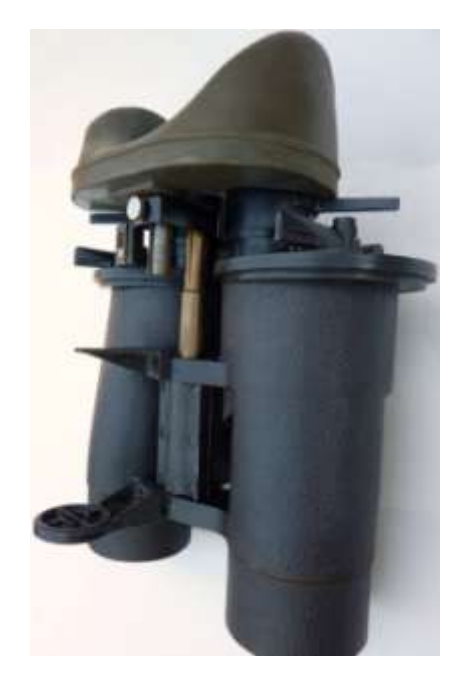
The ring sight; Copyright pictures Anna Vacani

The binocular is fixed with the short type mounting bracket with vertical locking clamp: