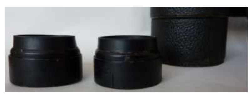
The eye cups

The objectives are fixed with the hoods; individually for both objectives.