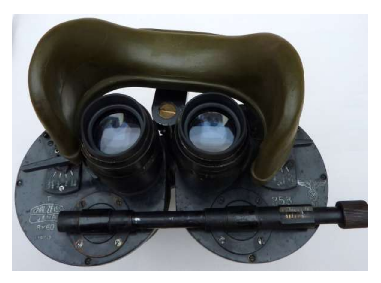
The binoculars' top with headrest; Copyright pictures Anna Vacani

8 x 60 Carl Zeiss Deck Mounted, production No. 1787295 - from our collection.