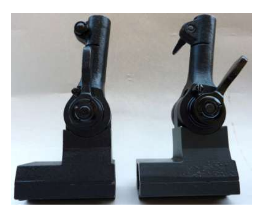
The mounting brackets