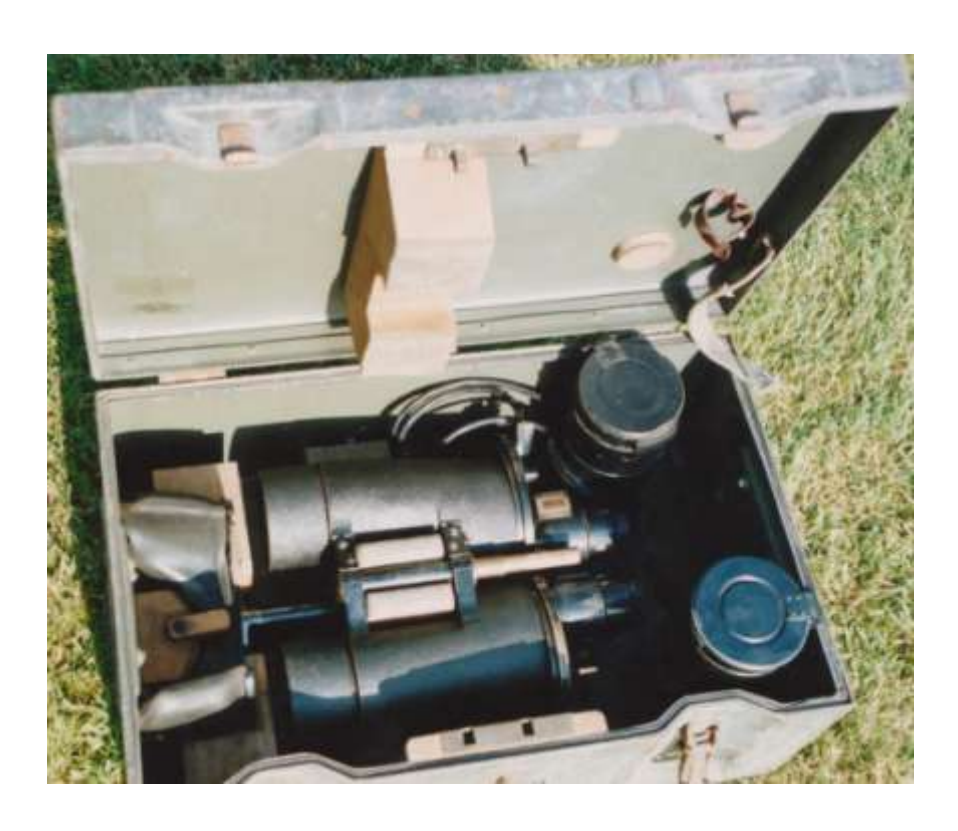
Pictures in our collection

The headrest, on our binocular, is not original, and the mounting bracket as well. All mechanisms are working well.