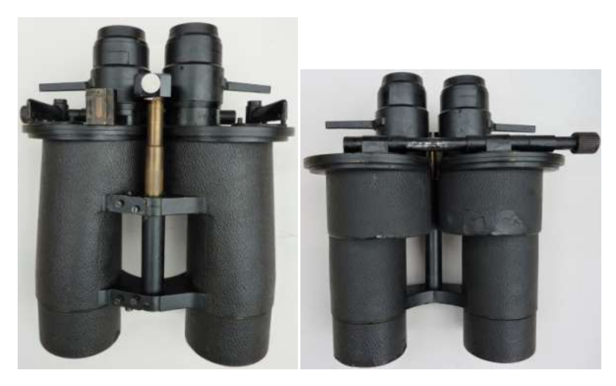
Both sides of the binocular (the ring sight and the mounting bracket is demounted for the picturing); Copyright pictures Anna Vacani

The model is named as 'Deck Mounted', by the collectors. It is very heavy binocular. The weight is -7.2 kg.