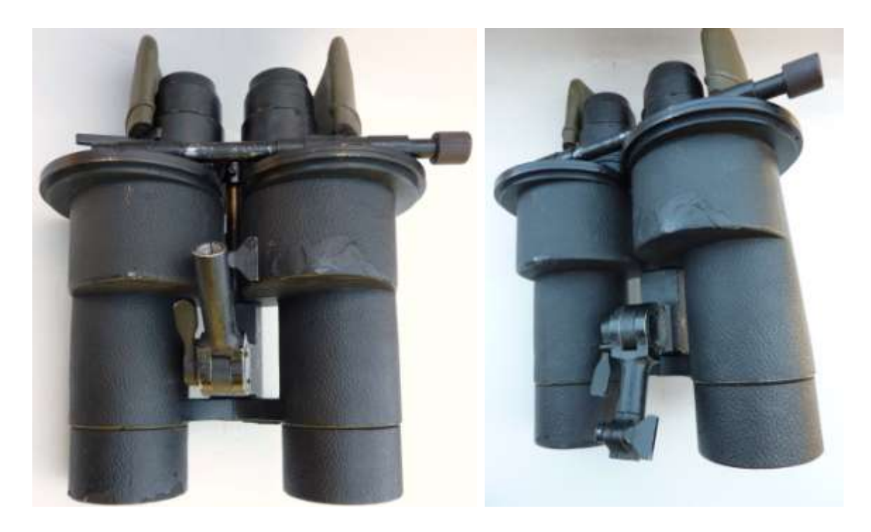
The mounting bracket; Copyright pictures Anna Vacani

The binocular is fixed with the short type mounting bracket with vertical locking clamp: