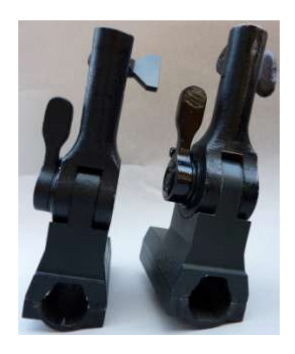
The mounting brackets